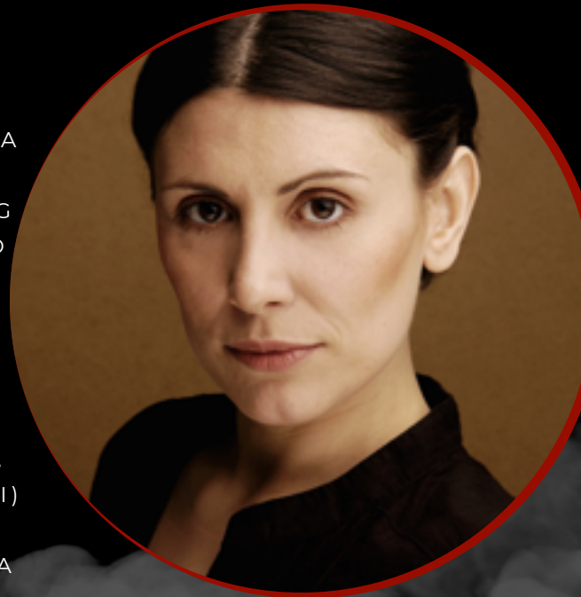
MOVEMENT DIRECTOR & CAST